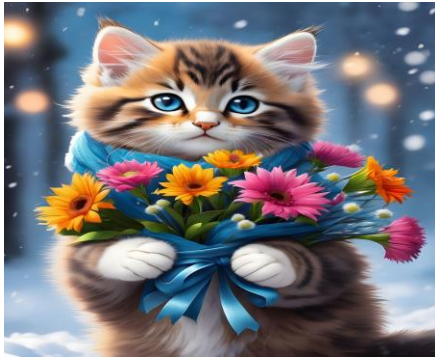
Happy Mother's Day